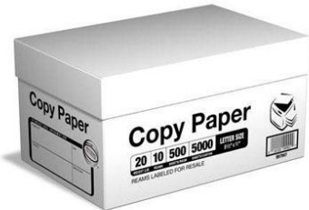
Copy Paper White