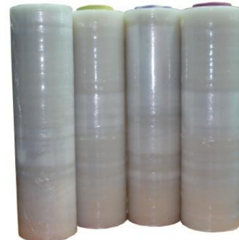
Stretch Cast Film Clear