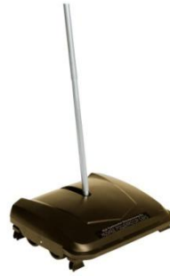
Continental 5325 Sweeper