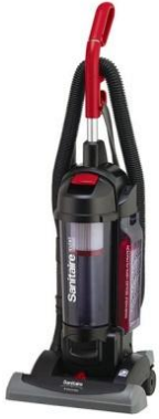
Sanitaire 5845 Bagless Vacuum