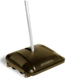
Continental 5327 Sweeper